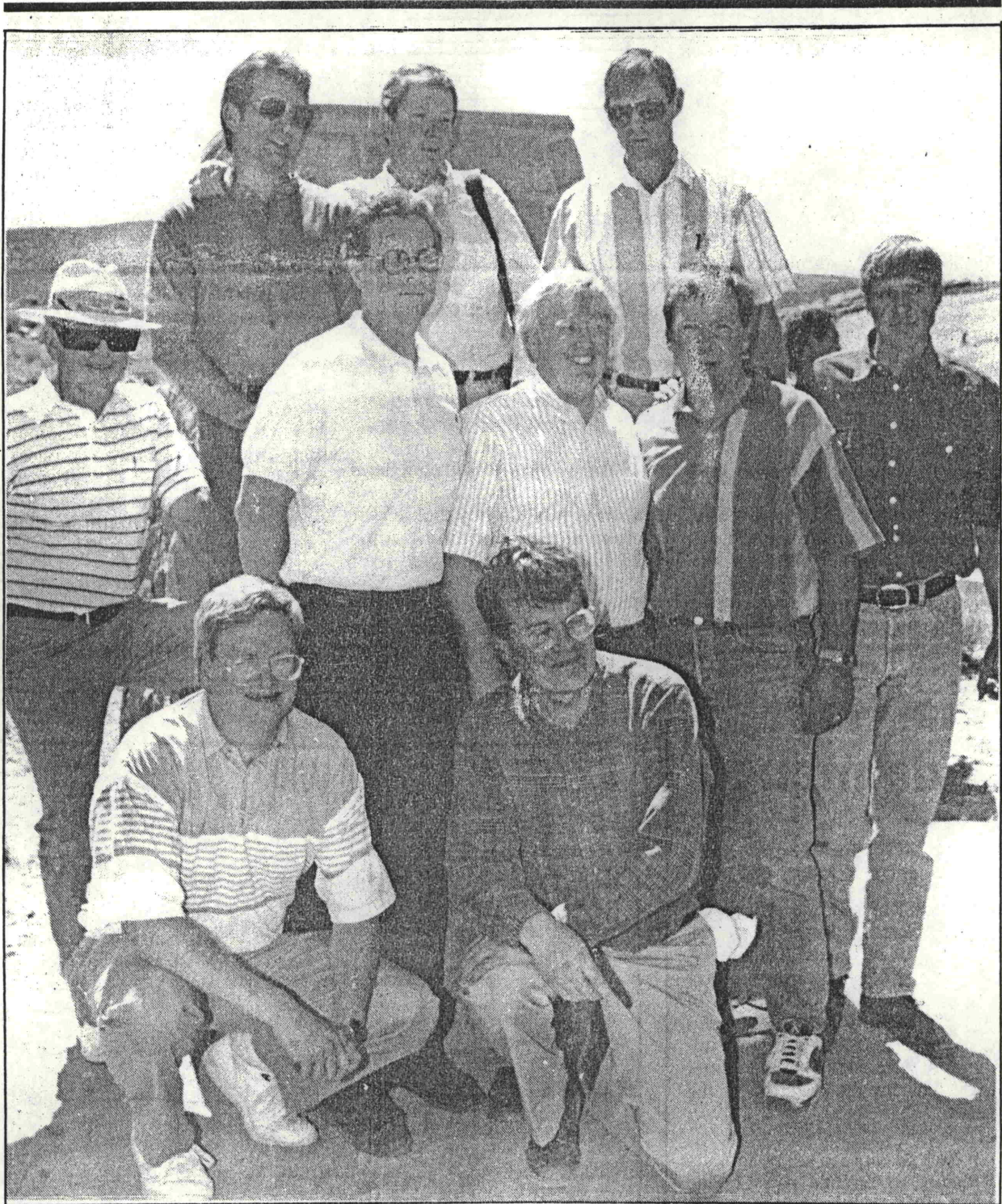
Survivors of the Boy Scout accident gather for a photo in front of the memorial.