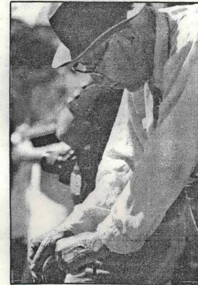
A man bows his head during the services.